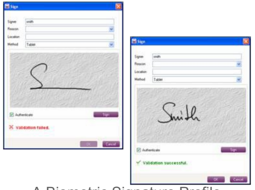
A Biometric Signature Profile – rejects invalid but accepts valid signatures (although multiple profiles can be set-up)